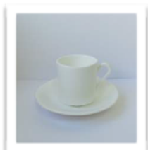
Demitasse Cup & Saucer

Height - 6.7cm Top Width - 6.3cm Bottom Width - 5.8cm Weight - 12g Capacity - 120ml