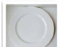
Sussex Chop Plate