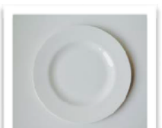
Sussex Tea Plate