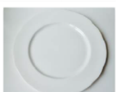
Amber Dinner Plate