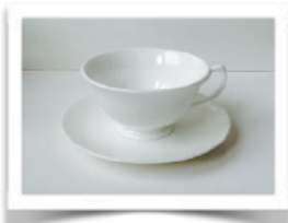
Maple Teacup & Saucer

Height - 5.5cm Top Width - 9.8cm Bottom Width - 4.9cm Weight - 15g Capacity - 170ml