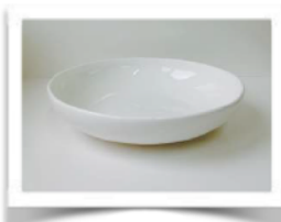
Stirling Pasta Bowl