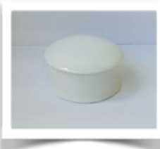
4" Trinket Box

Height Including Lid - 4.9cm Weight- 150g