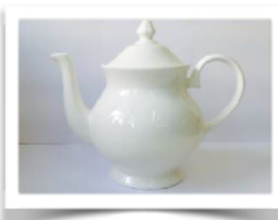
Sussex Large (6 Cup) Teapot