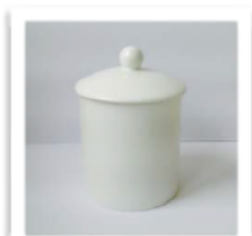
Lidded Pot (Various Tops Available)

Height - 6.7cm Top Width - 6.3cm Bottom Width - 5.8cm Weight - 12g Capacity - 120ml