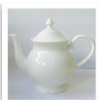
Sussex Medium (4 Cup) Teapot

Weight - 775g Height including Lid - 14.5cm Capacity - 1000ml