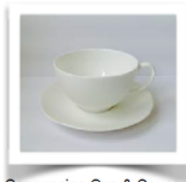
Cappuccino Cup & Saucer

Height - 5.5cm Top Width - 9.8cm Bottom Width - 4.9cm Weight - 15g Capacity - 170ml