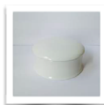
3" Trinket Box

Height Including Lid - 3.4 cm Weight - 70g