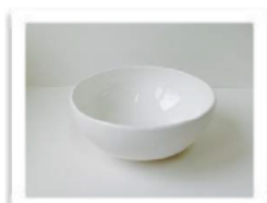
Stirling Breakfast Bowl