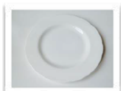
Amber Tea Plate