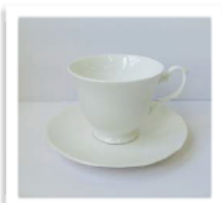
Coral Cup & Saucer

Height - 6.5cm Top Width - 7.7cm Bottom Width - 4.4cm Weight - 13g Capacity - 150ml