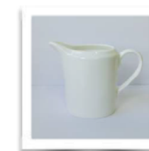
Stirling Cream Jug

Height 5.4cm Top Width - 8.2cm Bottom Width - 7.9cm Weight - 160g Capacity - 200ml