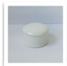
2" Trinket Box

Height Including Lid - 12cm Weight - 315g