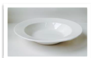
Sussex Rimmed Soup