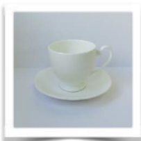
Sussex Coffee Cup & Saucer

Height - 7.1cm Top Width - 8.5cm Bottom Width - 4.6cm Weight - 16g Capacity - 190ml