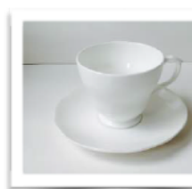
Amber Tea Cup & Saucer

Height - 8cm Top Width - 9.7cm Bottom Width - 5.1cm Weight -21g Capacity - 310ml